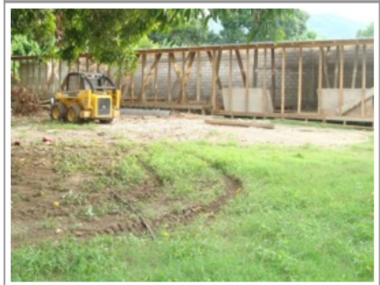
↑The construction of the temporary elementary school building, included 7 classrooms and an office, was aided by the new skid-steer. ↑ ↓The new wall was reinforced with rebar ever six inches in the block and surrounded the whole 5 acre property.