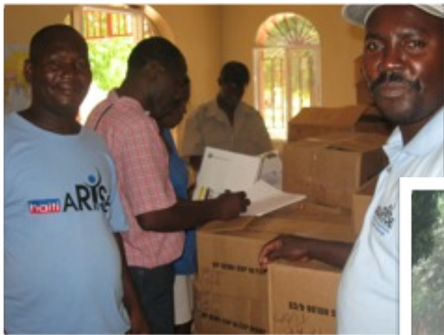
Distribution of food aid from the container. ↑ Rubble clean-up employed lots of local Haitian in need of work. →

Summary of Activity: After the earthquake in January 2010, there was extensive damage to Haiti ARISE property in Haiti. The perimeter wall was completely collapsed, the water tower collapsed and the resident building had some damage. With these funds, the wall was rebuilt, rubble from the water tower was cleaned up and repairs were made to the resident building. A shipping container was also received with disaster relief supplies that were distributed to the community, and a new temporary elementary school building was constructed to help meet the need for schooling due to numerous schools in the area being destroyed in the quake. Classes opened Oct 2010.