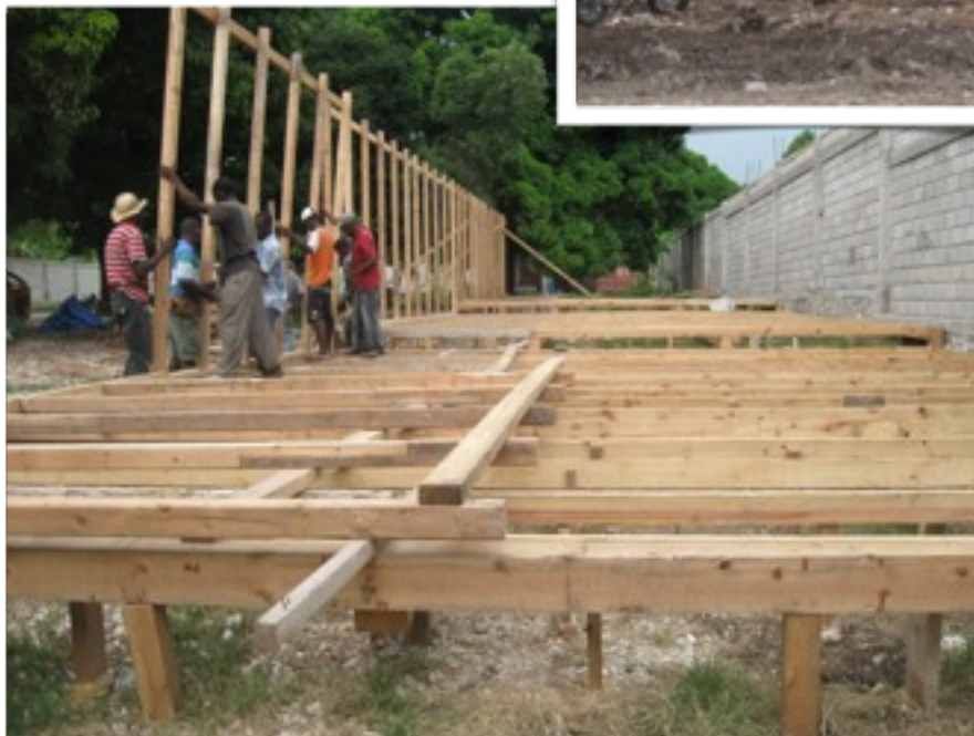
← Construction crew putting up walls for temporary school building. This wood and plywood structure is an immediate solution to the need for education, but not a permanent one.