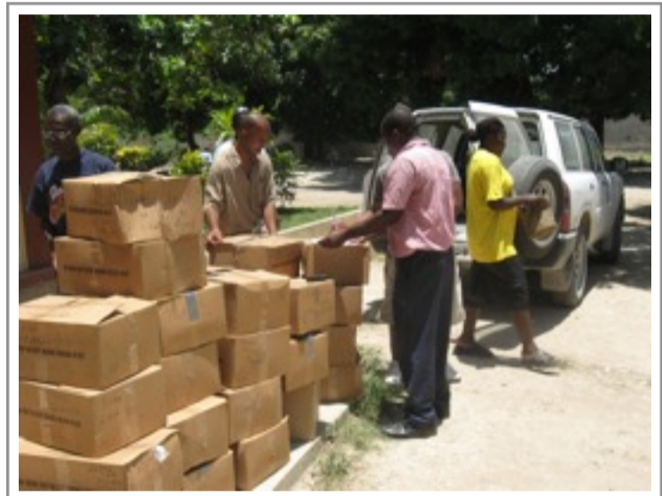
↑ Container unloaded- food, construction materials, bobcat. Aid distributed to other NGO's, community members, hospital & schools ↑ ↓Cracks throughout the resident building were patched and then painted.