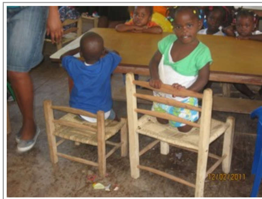
↑ Purchased 132 chairs & 250 small blackboards for the pre-school.