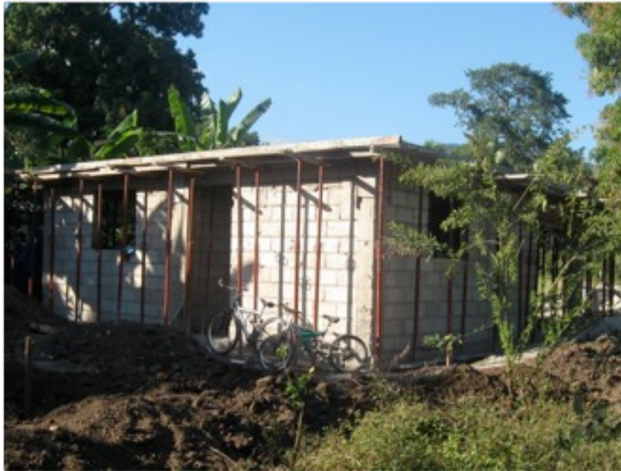
↑ The first of three homes being built as a part of EachONE BuildONE program.

HAITI ARISE MINISTRIES INC. (USA) SENT FUNDING FOR BUILDING PROJECTS AND CAPITAL PURCHASES FOR HAITI ARISE MINISTRIES (HAITI) INCLUDING HOME REBUILDING, FUNDS TO COMPLETE WALL CONSTRUCTION FOR CHILDREN'S VILLAGE, PURCHASE OF TRUCK & BLOCK-MAKER FOR REBUILDING PROJECTS, AS WELL AS EDUCATION FUND SUPPORT AND ELEMENTARY SCHOOL SUPPLY FUNDS, TOTALING $85,650 US.