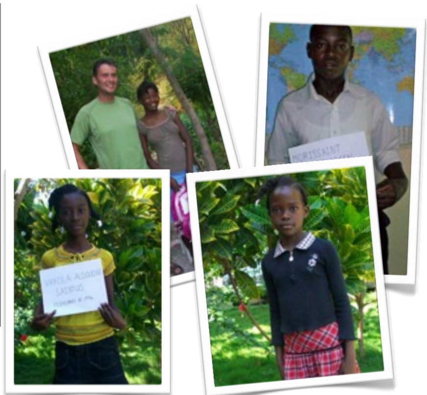
Education Fund program funded 25 students, covering school fees, books and materials. Of these, 3 were specifically sponsored. ↑