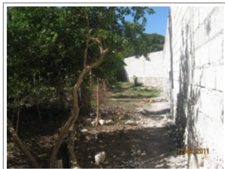
Portion of the wall that had to be built with block to prevent water entry. ← This portion was negotiated with the neighbors in order to straighten out the line. There would have been a zigzag jog in the middle otherwise.