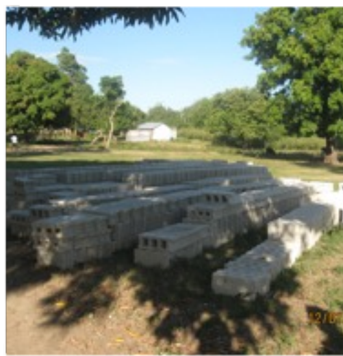
Blocks made with new block-maker for homes →