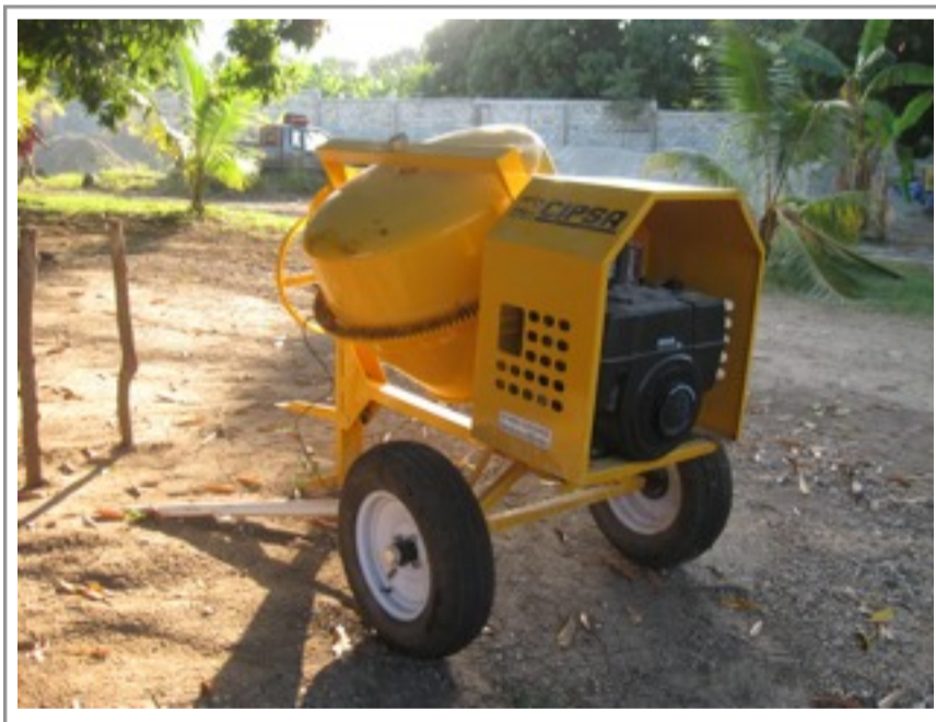
↑ Cement mixer purchased for the home rebuilding program.