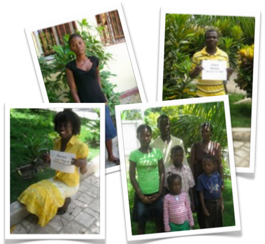
Education Fund program funded 76 students, covering school fees, books and materials. Of these, 3 are specifically sponsored. ↑