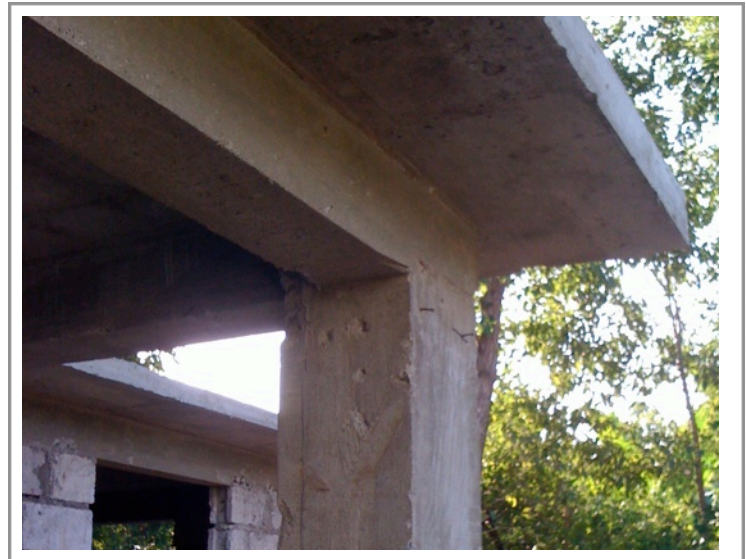
↑ All the posts, floor and roof were poured solidly, requiring very little touch up parging.

↓ The homes are wired with electrical conduit in each room & block windows, providing increased privacy and security. ↓