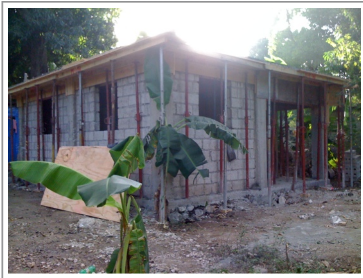
↑ The houses are formed with lumber and shores for the concrete roof.