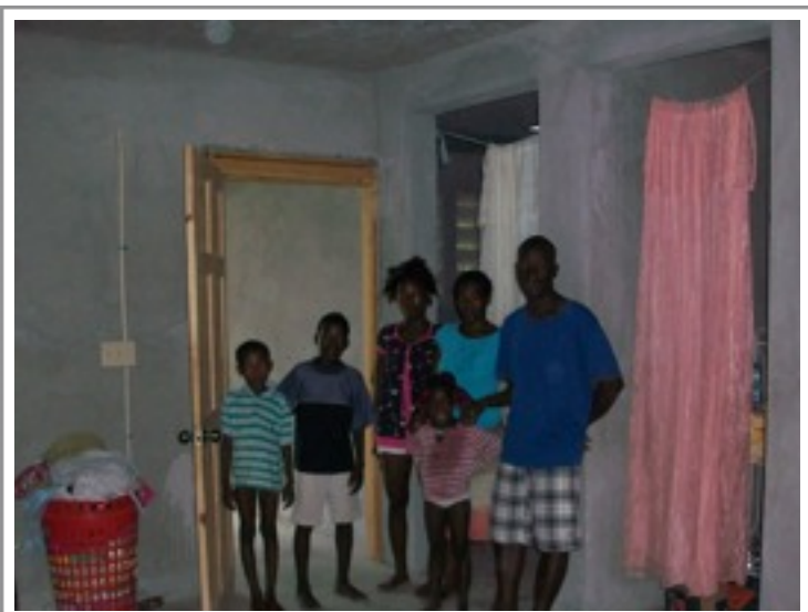
↓ The homes are wired with electrical conduit in each room. Wood doors & block windows provide increased privacy and security. ↓