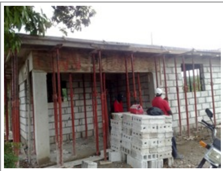
↑ The houses are formed with lumber and shores for the concrete roof.