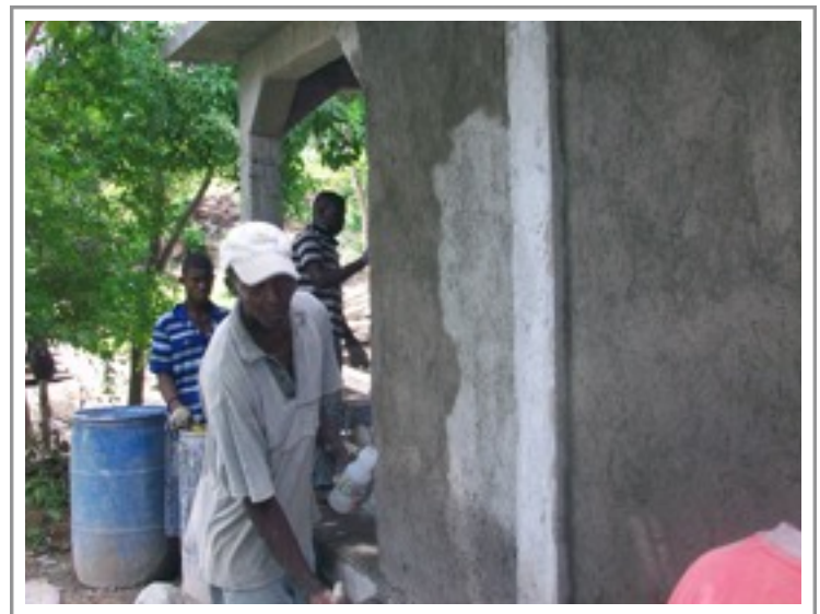
↑ All the posts, floor and roof were poured solidly, requiring very little touch up parging. Block walls are all parged.